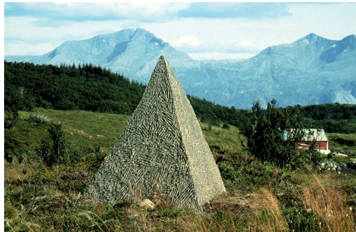
The triangular form sculpture.

© David Kinsella. Courtesy of Nordland Fylkeskommune.