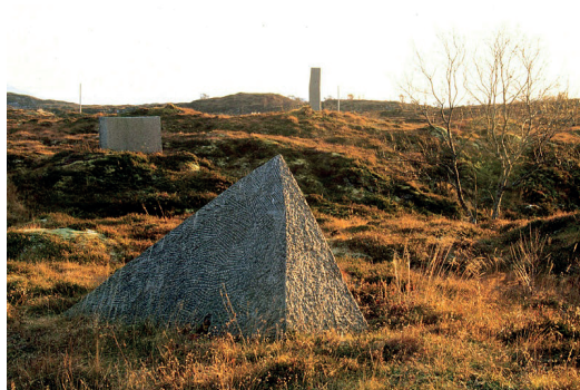
A New Discussion sculptures.

The elaboration of this issue would not have been possible without the generosity of Riika Vepsä-Tapper, to whom we want to show special thanks for the cession of the rights to republish this text originally published at the Skulpturlandskap Nordland website. Particular thanks also to the Nordland Fylkeskommune for the cooperation by enthusiastically accepted to provide the rights for the reproduction of the site photographs.