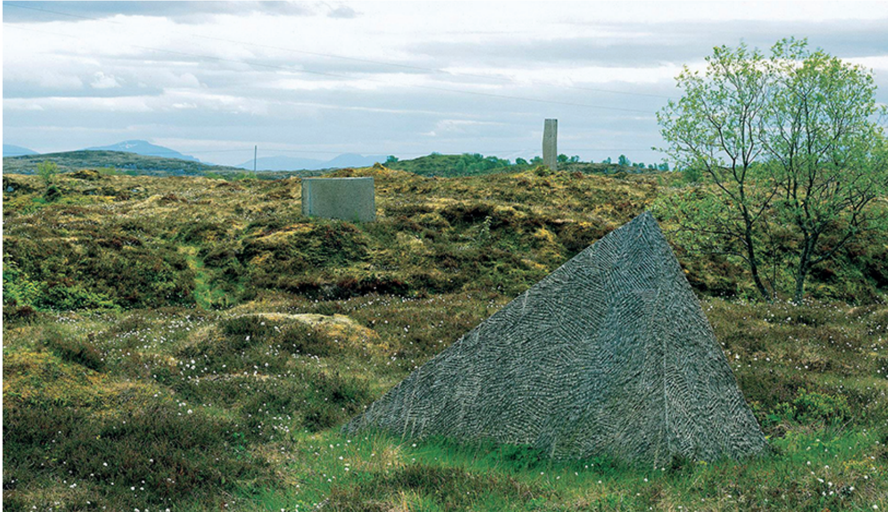
General view of the three sculptures.

© David Kinsella. Courtesy of Nordland Fylkeskommune.