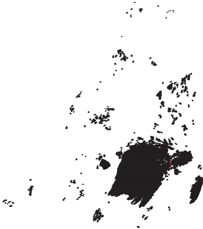
Map of Vega. Location of the sculptures A New Discussion .

© Developed by Márcia Nascimento and Nuno Costa.