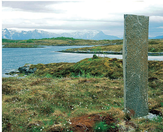
The vertical form sculpture.