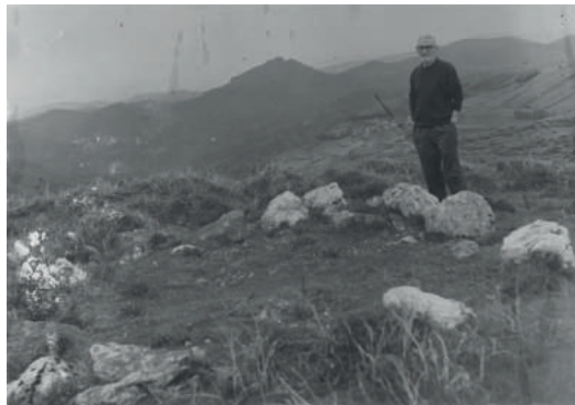
Jorge Oteiza next to the remains of a Cromlech, 1965

- 'It is essential -he said- to fill our landscape with funerary stelaes, with strategically lit signals arranged in this long night that we do not want to arouse. A kind of spiritual batteries, something that speaks to us from its serene vigilant spatiality, while we nervously count our moneys.'"