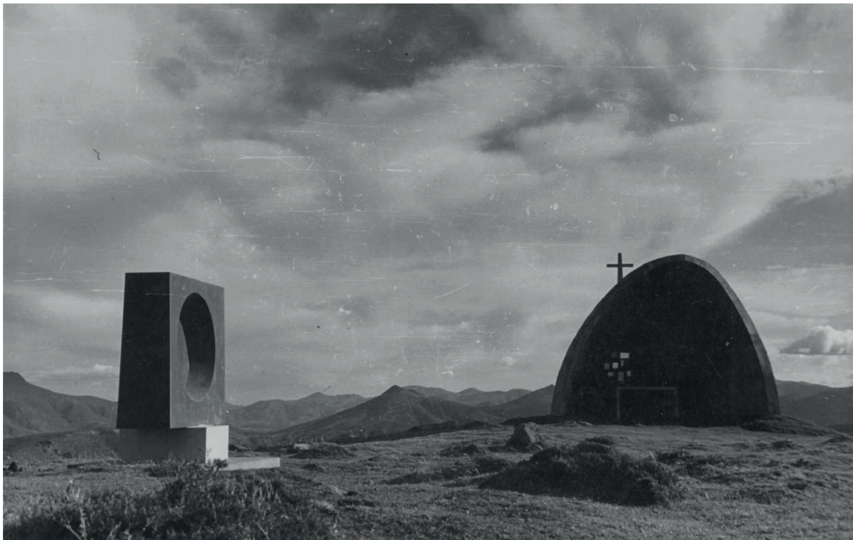
Memorial Aita Donostia: Funeral Stele and Chapel, Agiña

[AFMJJO]