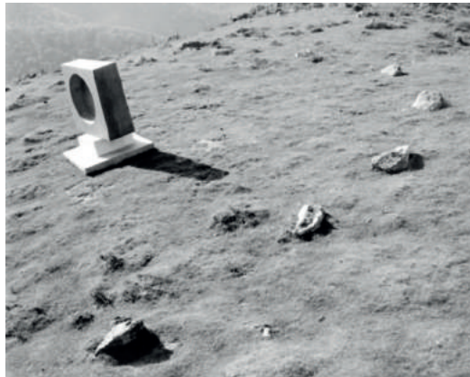
Funeral Stele and cromlech in Agiña

[AFMJJO] © Jorge Oteiza © Pilar Oteiza, A+V Agencia de Creadores Visuales, 2020