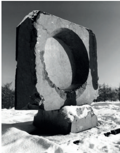
Funeral Stele (damaged)

[AFMJJO] © Jorge Oteiza © Pilar Oteiza, A+V Agencia de Creadores Visuales, 2020